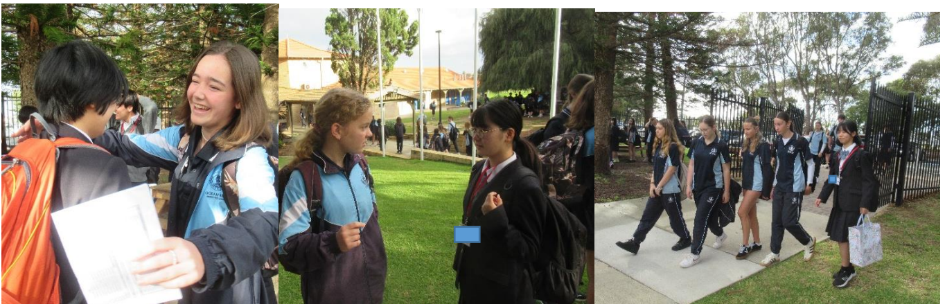
From our first hello, the students quickly adapted to their new Australian classroom settings.