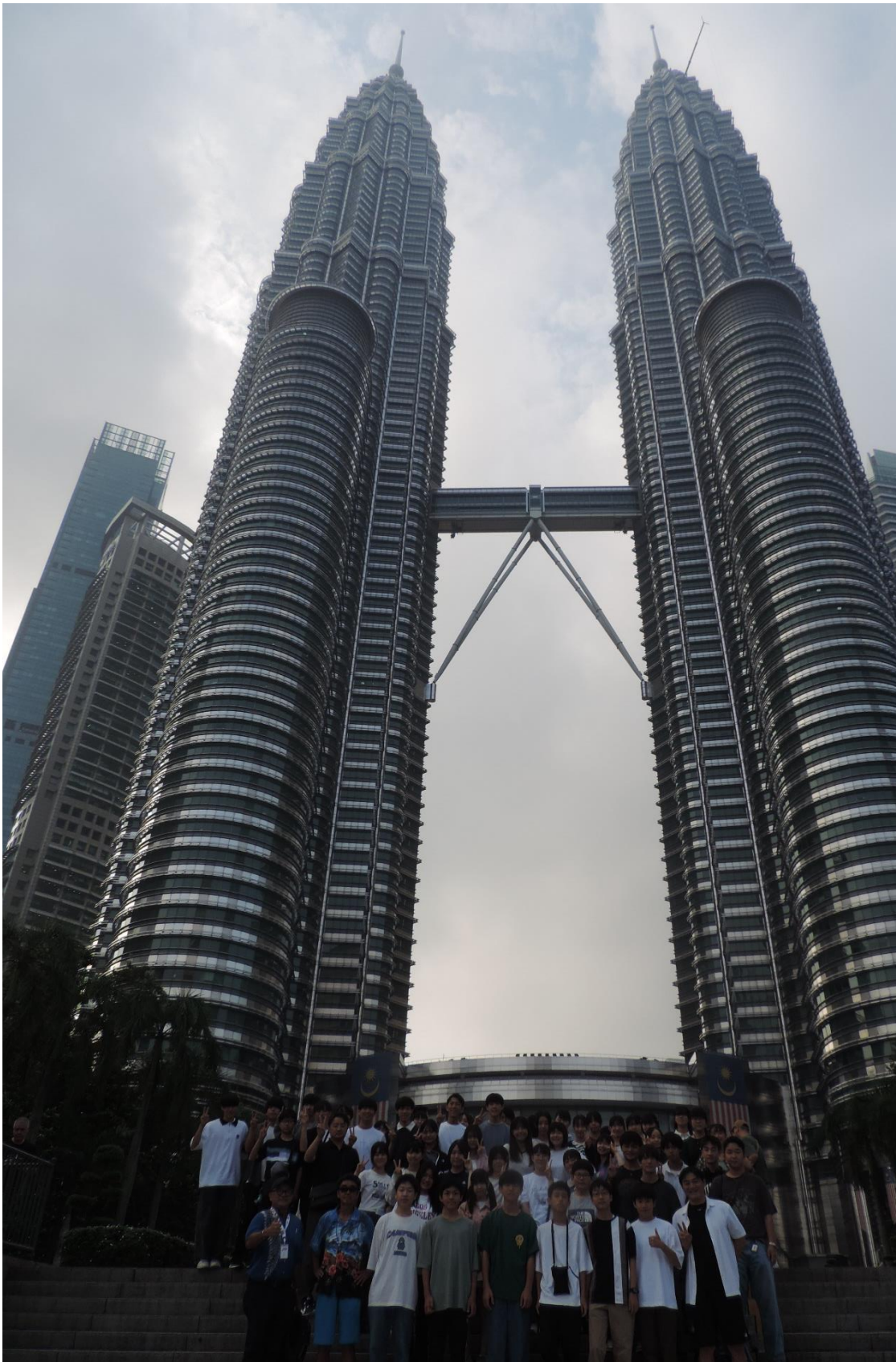
Petronas Twin Towers (ペトロナスツインタワー)

Returning back to our homes, the stop in Kuala Lumpur , Malaysia was filled with many sights to behold.