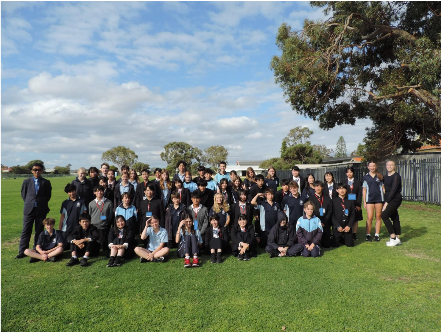
The students being welcomed with a familiar warmth only found with friends and family.