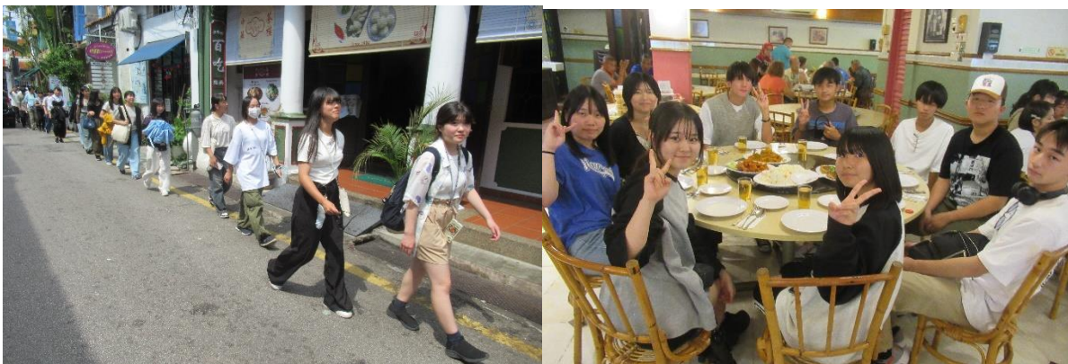
Straits of Malacca (マラッカ海峡)