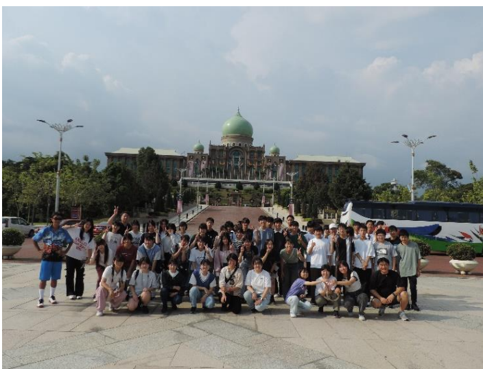
Pejabat Perdana Menteri Malaysia (マレーシア首相官邸) Masjid Putra (プトラモスク)