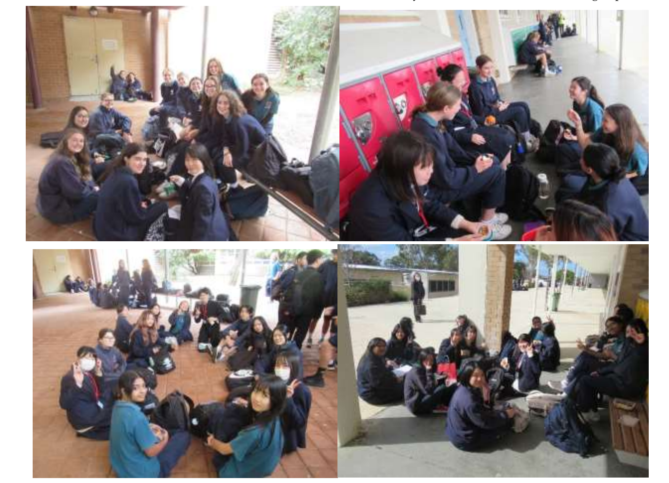
The students exchanged information.

Each buddy has his or her heart in the right place.