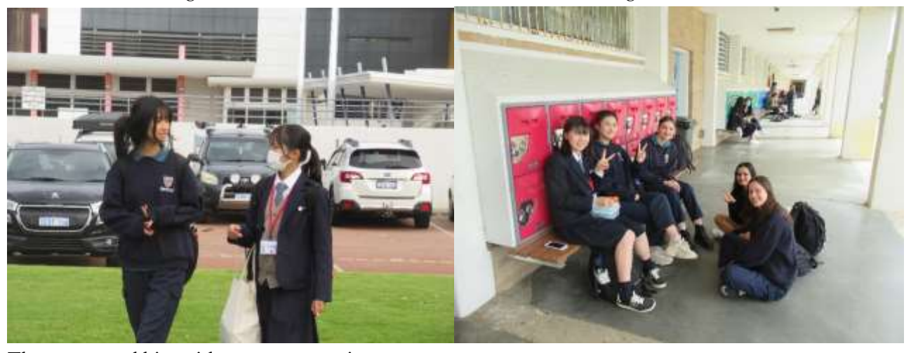
They peppered him with so many questions.