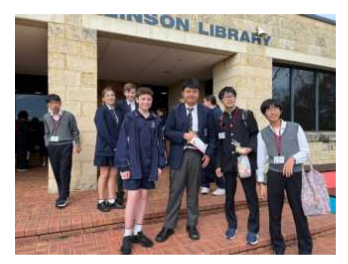
A fun lesson with our buddies