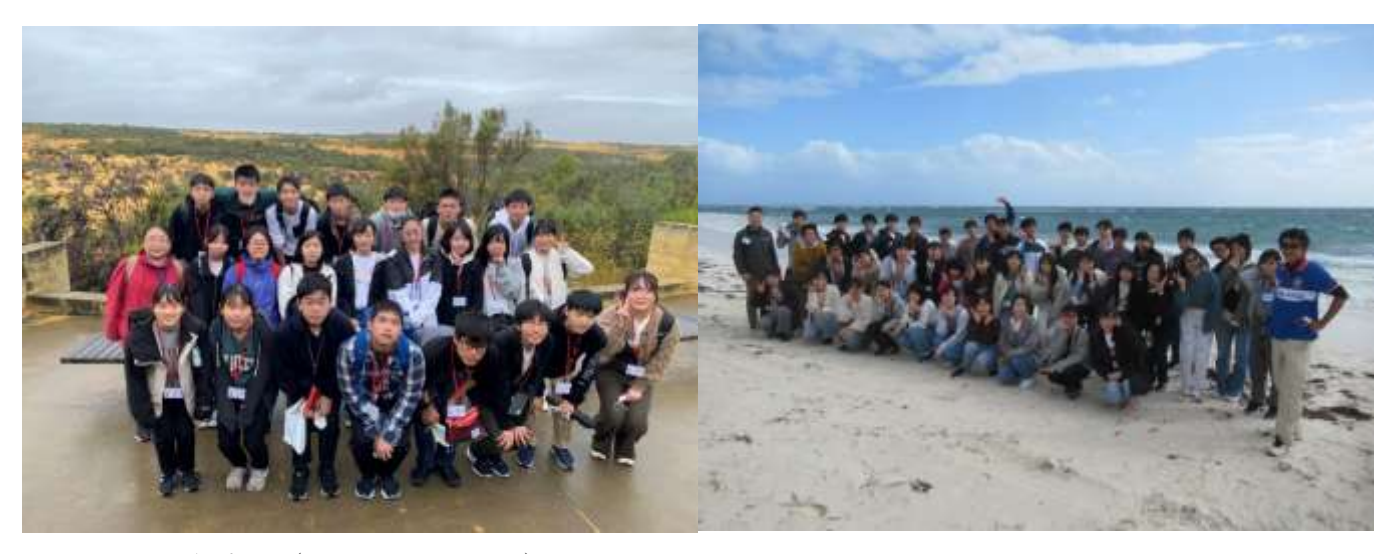
シンガポール経由 ( Via Singapore )