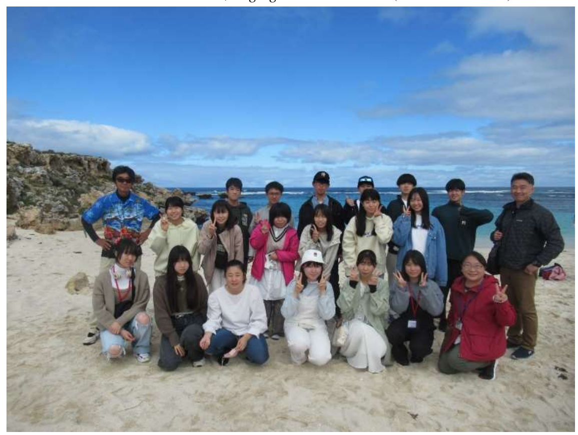
We enjoyed, gleaming white beaches, crystal clear waters at Rottnest Island. The scenery fed our eyes and hearts . (Year 10 students )